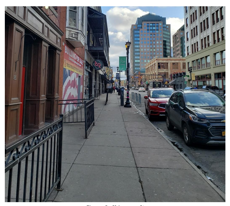
Figure 8. Chippewa St