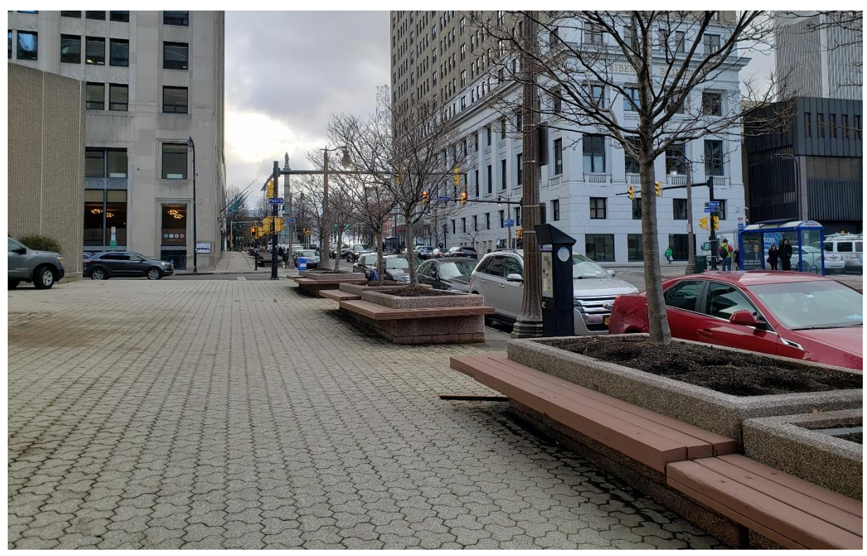
Figure 5. Court St (near Pearl St)