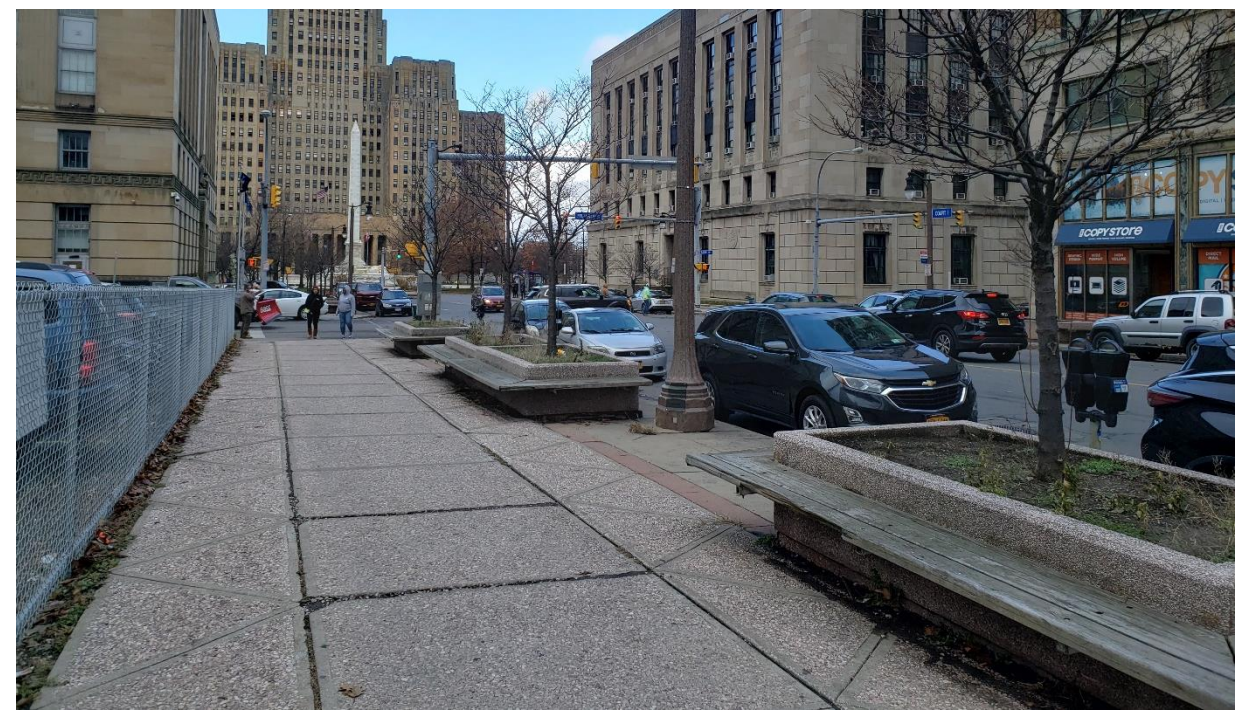
Figure 2. Court St (at Franklin St) – Facing Niagara Sq