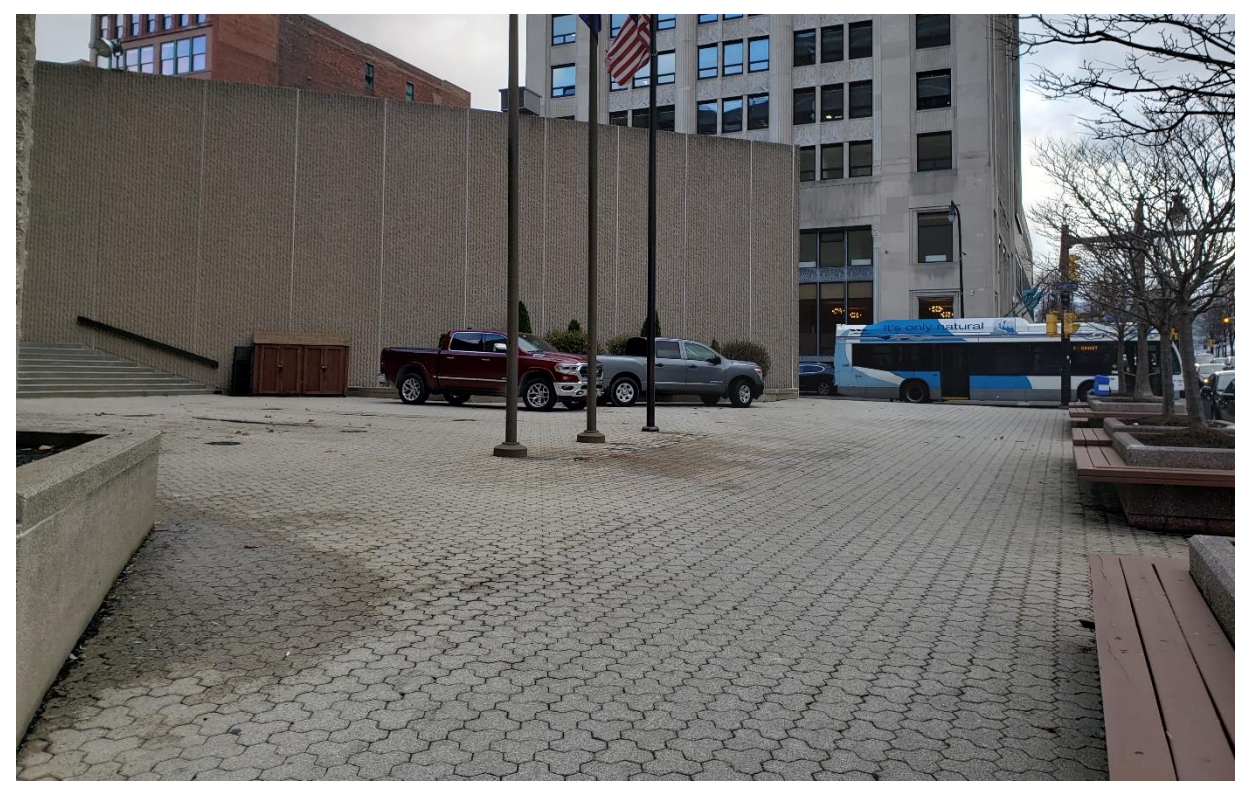
Figure 3. Court St (near Pearl St) – Buffalo Niagara Convention Center Plaza