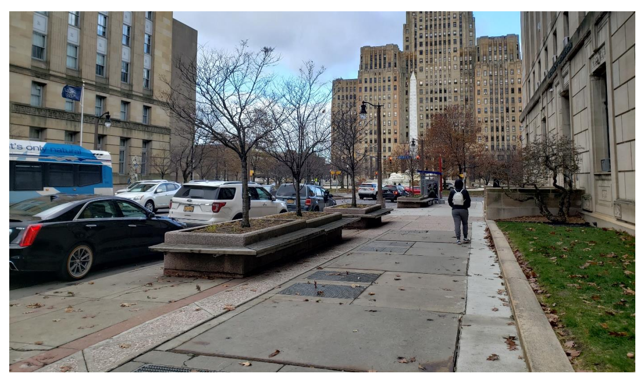
Figure 1. Court St (at Franklin St) – Facing Niagara Sq