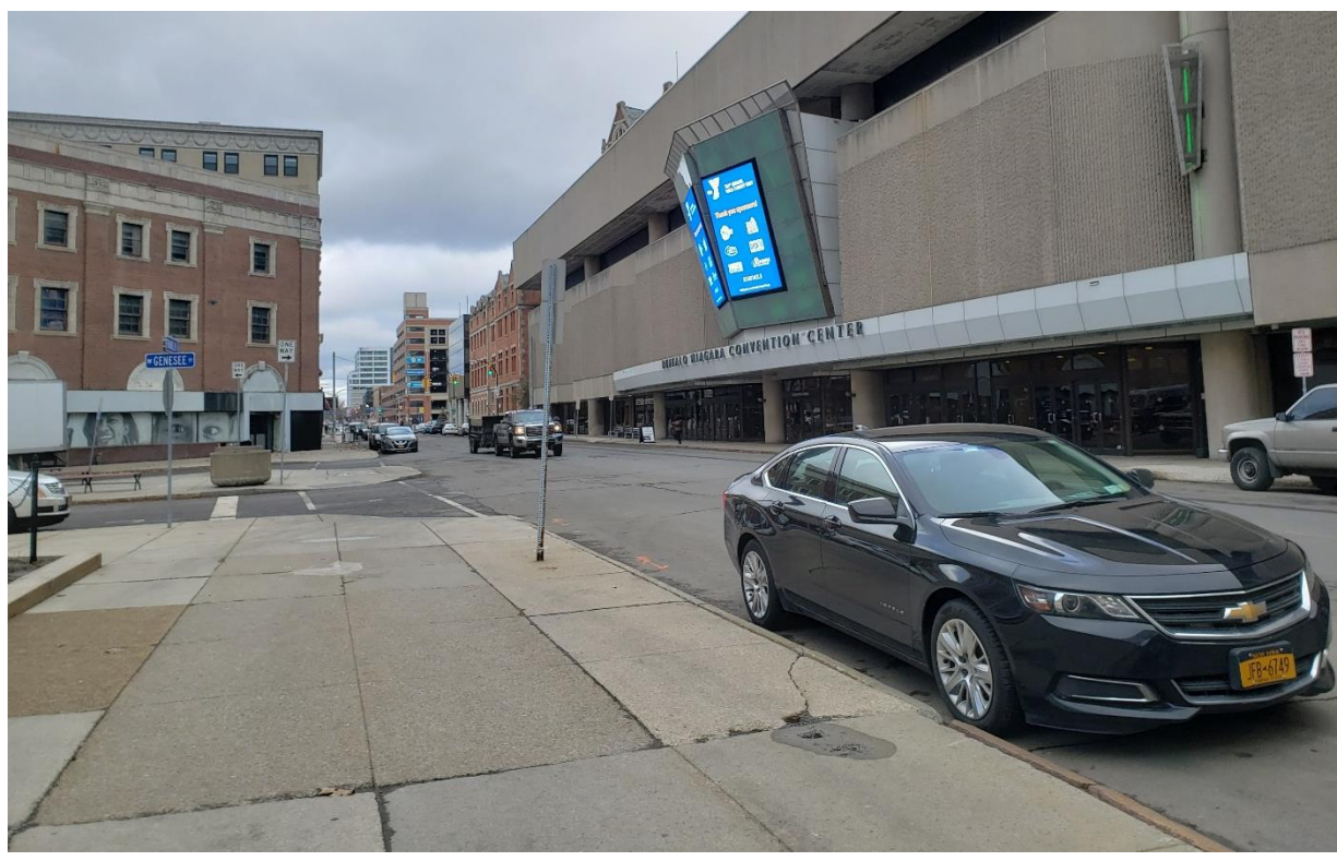
Figure 6. Franklin St (at Genesee St) – In Front of the Buffalo Niagara Convention Center